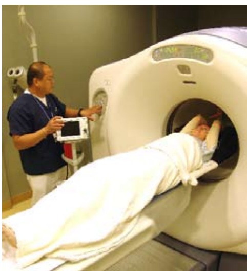
PET/CT scan.

Although nuclear medicine has already made enormous contributions to biomedical research and disease management, its promise is only beginning to be realized in such areas as drug development, preventive health care, and personalized medicine. However, aging facilities and equipment, a shortage of trained nuclear medicine scientists, and loss of federal research support are jeopardizing the advancement of the field. At the request of the Department of Energy (DOE) and