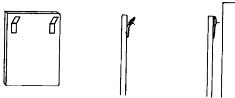
Figure 6. A method of invisibly attaching poster components to display board.